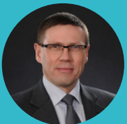
ASKO POHLA CHAIRMAN OF THE COUNCIL OF THE ARBITRATION COURT OF ESTONIAN CHAMBER OF COMMERCE AND INDUSTRY