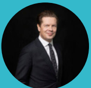
STEFFEN PIHLBLAD SECRETARY GENERAL OF THE DANISH INSTITUTE OF ARBITRATION