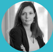
LAURENCE PONTY ARCHIPEL